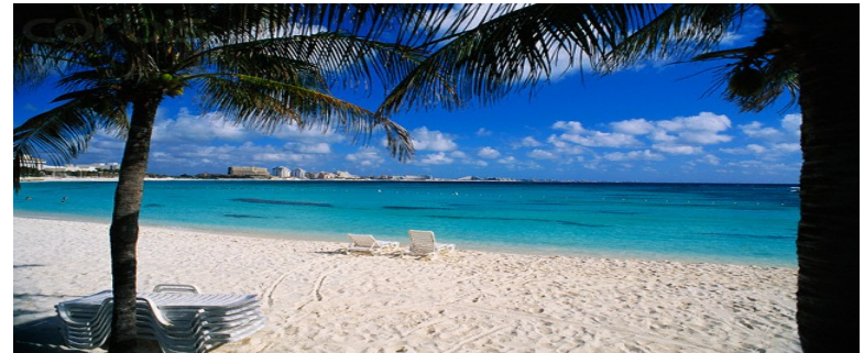
Illustration 2: Jamaica/ The Caribbean