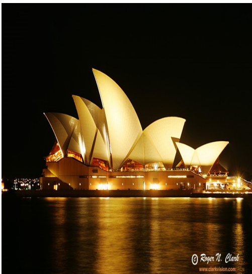
Illustration 3: The Opera House, Australia