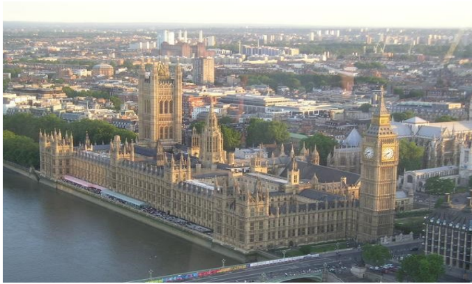
Illustration 1: Central London

The following Wild Card demonstrates my ability to express my personal thoughts in the form of writing. I have chosen to write an informal piece on my desire to travel because I am passionate about pursuing my goal of viewing the world. In my free write, I have utilized certain aspects of formal writing such as the correct use of grammar, variation of sentence structure and logical presentation of my ideas. My utilization of these aspects of writing illustrate that writing techniques are imperative for effective presentation of one's thoughts regardless of writing style. I have also included a few illustrations to capture the attention of my reader.