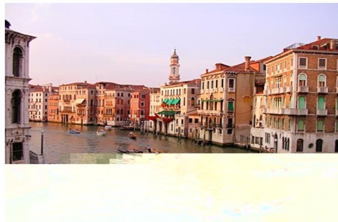
Illustration 5: Venice, Italy