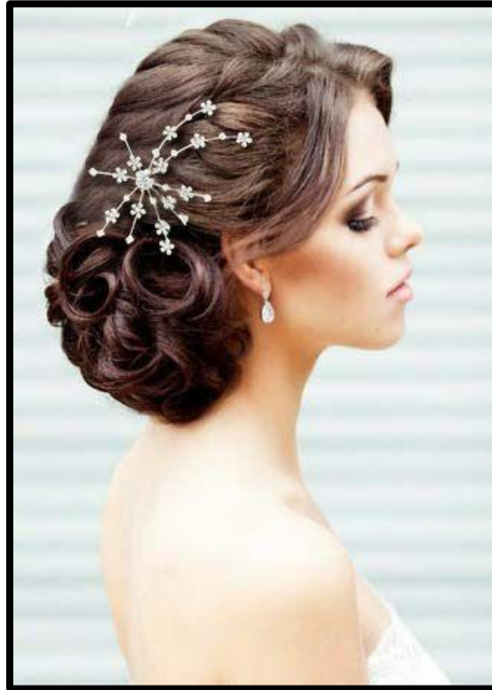
(Photograph of Hair)

scene so that she can tear it down as she realizes she has been viewed as a doll. She may look better off under Higgins's teachings, but because of how society functions towards women and towards Hispanics, he takes more from her than she's willing to lose, and her exterior finally begins to reflect her emotions instead of the desires of society.