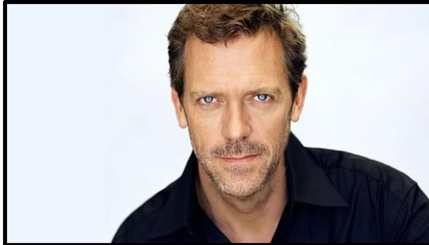
(Photograph of Hugh Laurie)

Henry Higgins is straightforward, pretentious, and insensitive; he is not quick to anger, does as he wishes, and has no manners. Hugh Laurie portrays his character on the television program House, M.D. with these exact characteristics, as seen in the following clip: