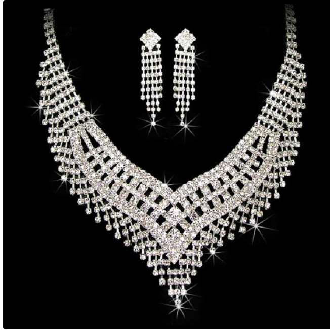
(Photograph of Jewelry Set)