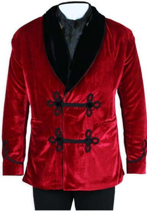
(Vintage Smoking Jacket)